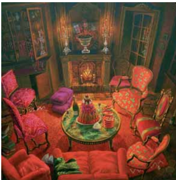
Grand Salon Rouge 150 x 150

Many of Le Chatelier's paintings are of the living room and kitchen at his country home—a former rectory located about 100 kilometers southeast of Paris. In fact the kitchen scenes that are so immediate they are like a visual version of onomatopoeia: you can almost hear the eggs frying and the bacon sizzling... on a stove crowded with a canister of sea salt, a pepper mill, a Dijon mustard jar, and other accoutrements of French cooking. "I paint in the kitchen when it gets cold in the winter," he says.